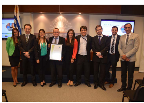
12/02/2014: THE SECOND AEO CERTIFICATE SARDÁ Y CIA. SC., CUSTOMS BROKER.